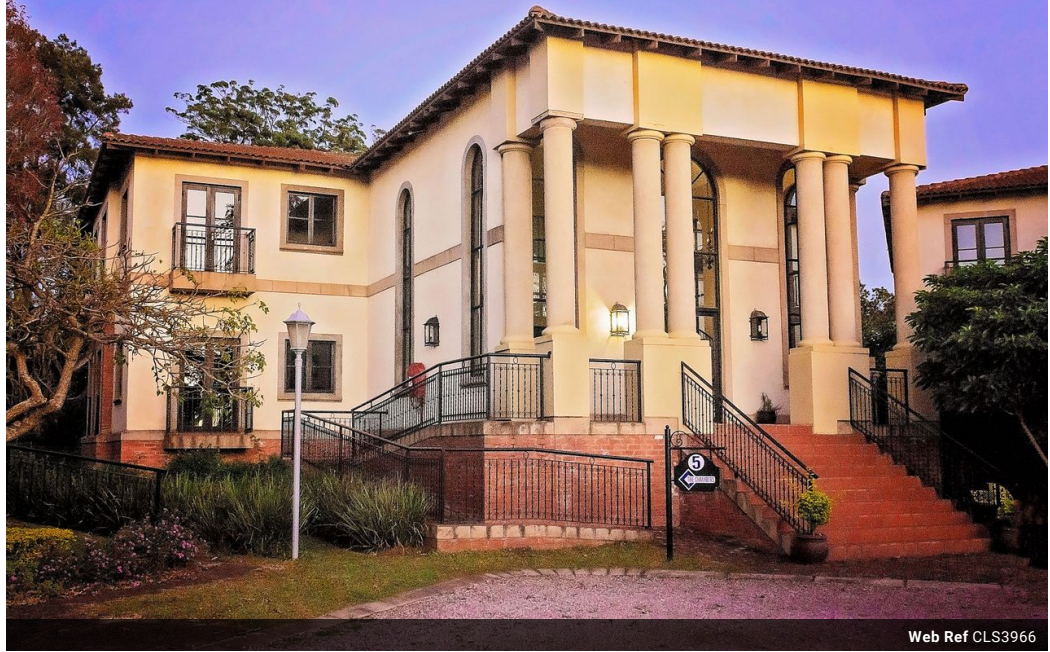
Web Ref CLS3966

1st Floor, Seeff Christians Village Shopping Centre (Pick 'n Pay Centre) 44 - 46 Old Main Road Hillcrest Durban 3610