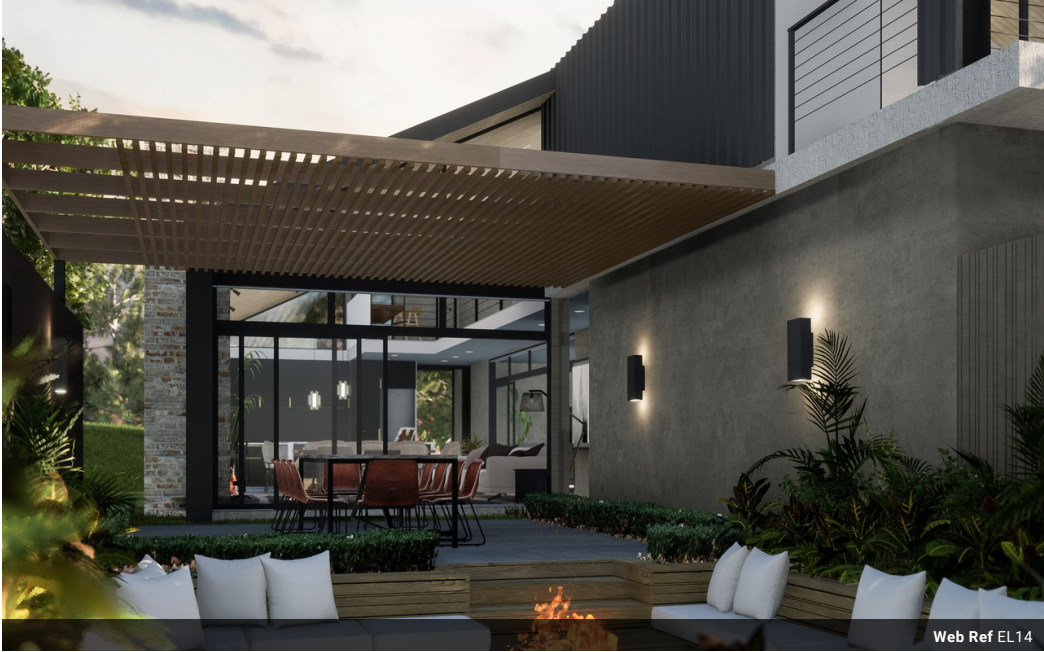
Web Ref EL14

1st Floor, Seeff Christians Village Shopping Centre (Pick 'n Pay Centre) 44 - 46 Old Main Road Hillcrest Durban 3610