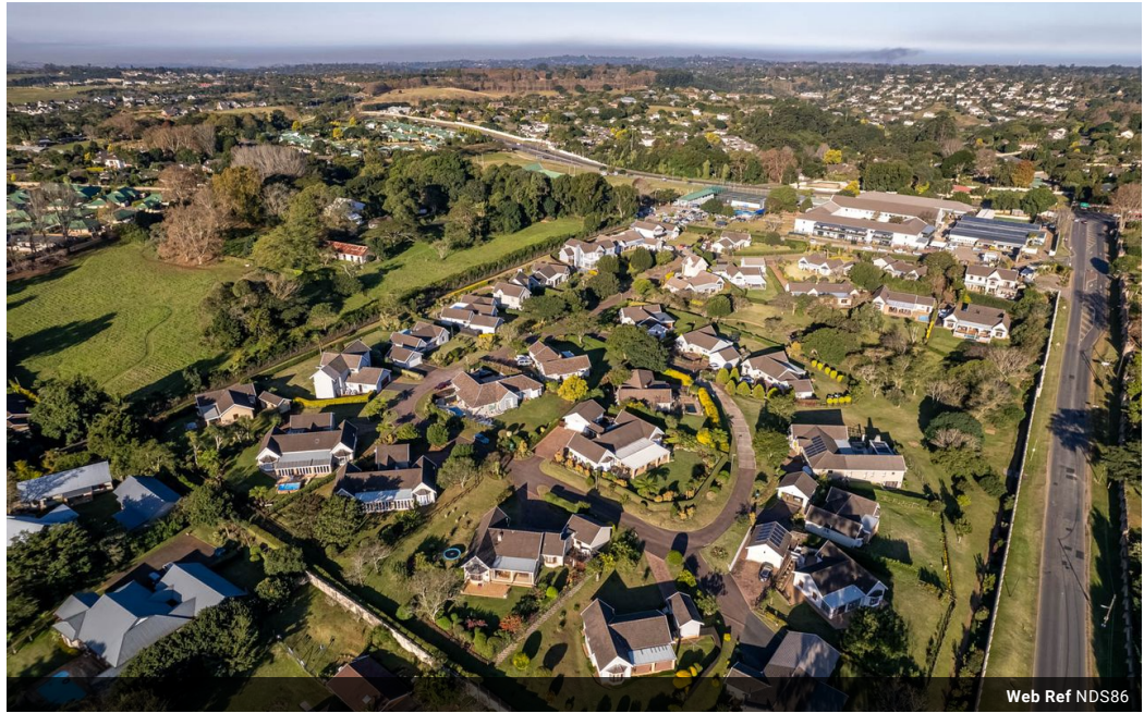
Web Ref NDS86

1st Floor, Seeff Christians Village Shopping Centre (Pick 'n Pay Centre) 44 - 46 Old Main Road Hillcrest Durban 3610