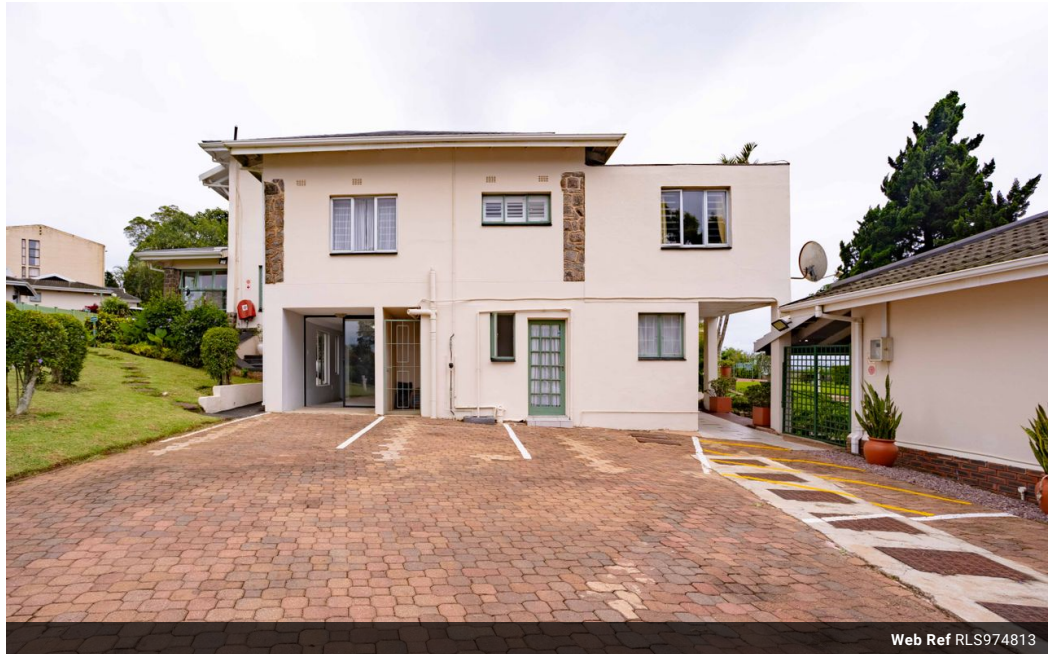
Web Ref RLS974813

1st Floor, Seeff Christians Village Shopping Centre (Pick 'n Pay Centre) 44 - 46 Old Main Road Hillcrest Durban 3610