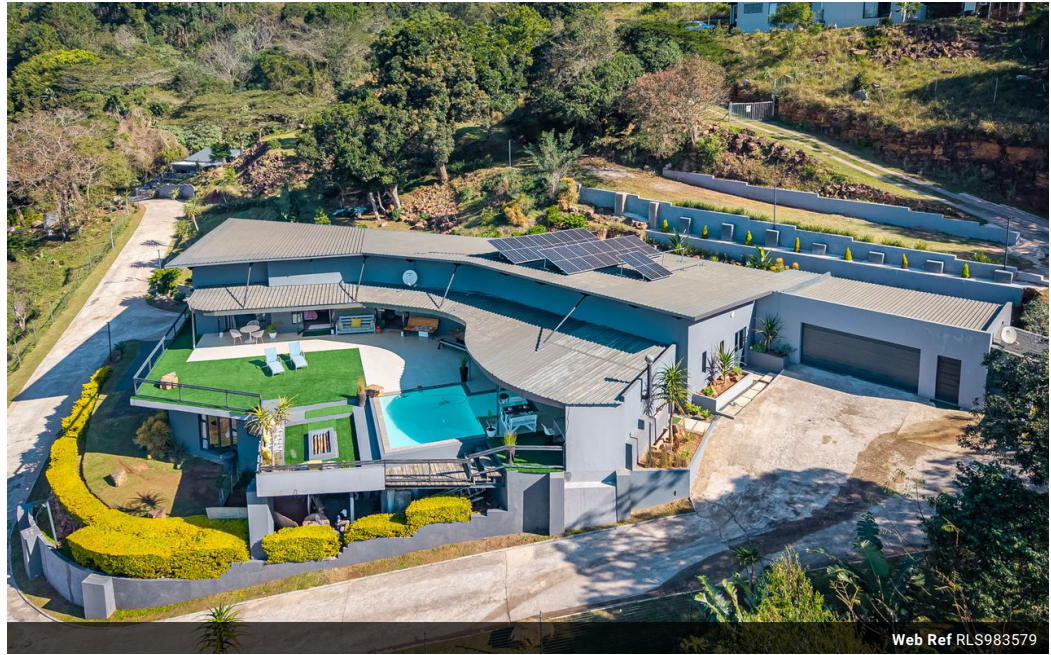
Web Ref RLS983579

1st Floor, Seeff Christians Village Shopping Centre (Pick 'n Pay Centre) 44 - 46 Old Main Road Hillcrest Durban 3610