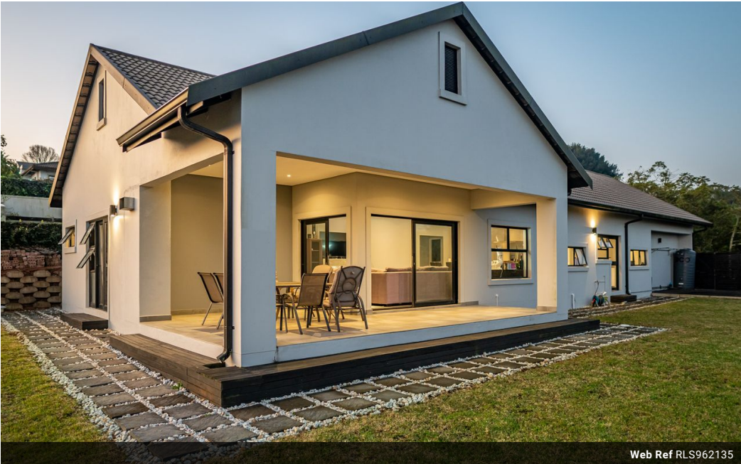
Web Ref RLS962135