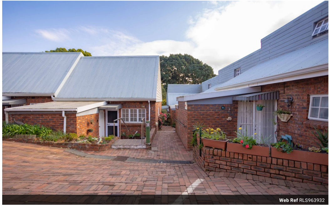
Web Ref RLS963932

1st Floor, Seeff Christians Village Shopping Centre (Pick 'n Pay Centre) 44 - 46 Old Main Road Hillcrest Durban 3610