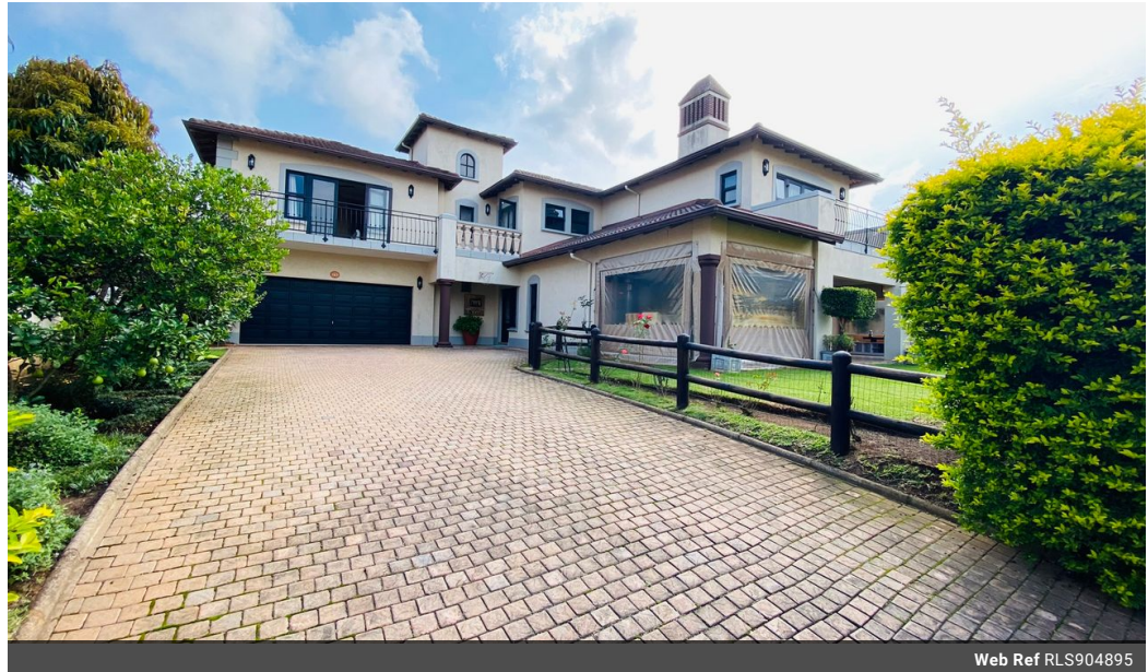
Web Ref RLS904895

1st Floor, Seeff Christians Village Shopping Centre (Pick 'n Pay Centre) 44 - 46 Old Main Road Hillcrest Durban 3610