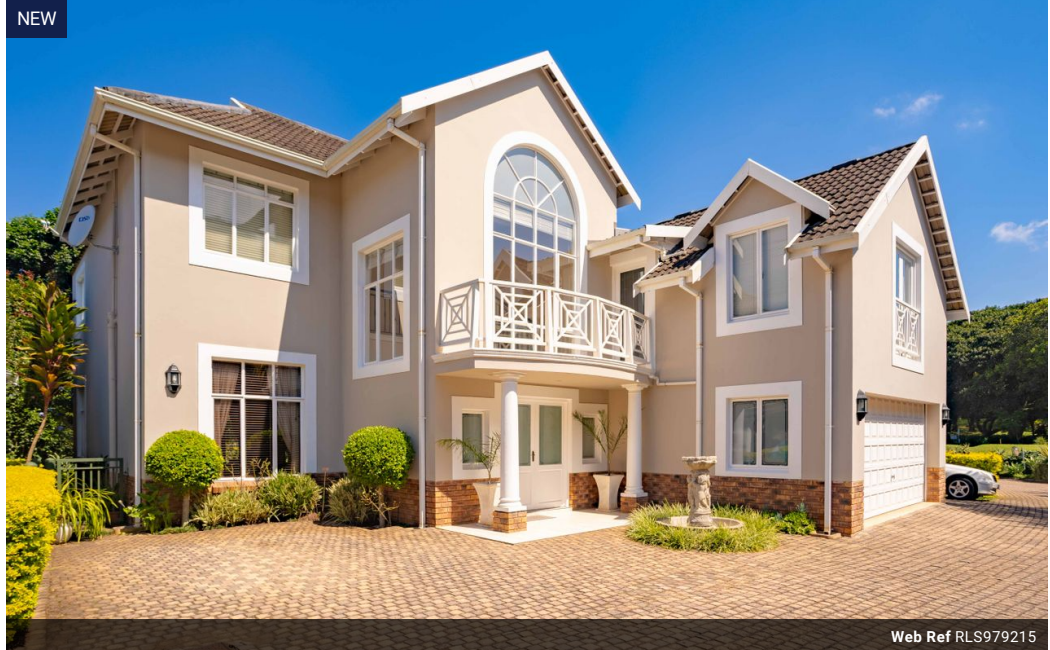
Web Ref RLS979215

1st Floor, Seeff Christians Village Shopping Centre (Pick 'n Pay Centre) 44 - 46 Old Main Road Hillcrest Durban 3610