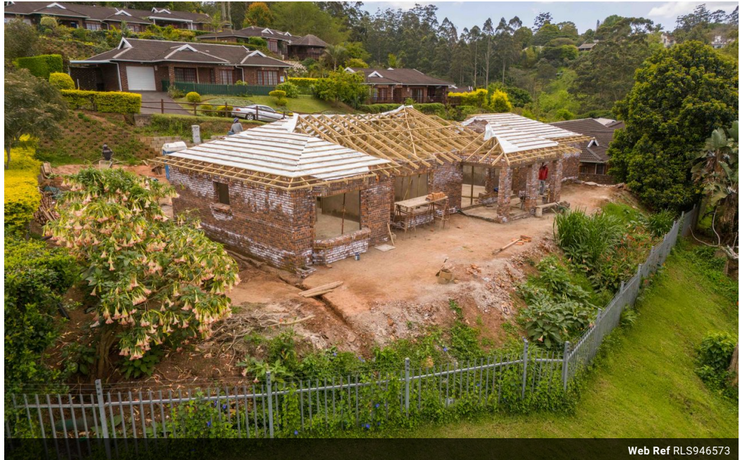
Web Ref RLS946573

1st Floor, Seeff Christians Village Shopping Centre (Pick 'n Pay Centre) 44 - 46 Old Main Road Hillcrest Durban 3610