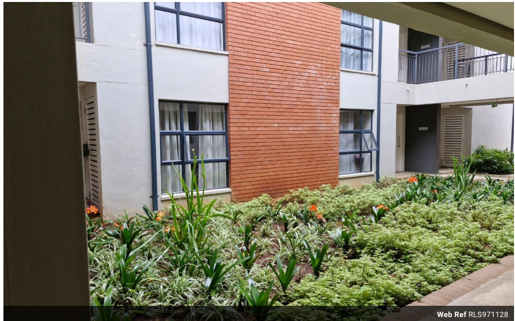
Web Ref RLS971128

1st Floor, Seeff Christians Village Shopping Centre (Pick 'n Pay Centre) 44 - 46 Old Main Road Hillcrest Durban 3610